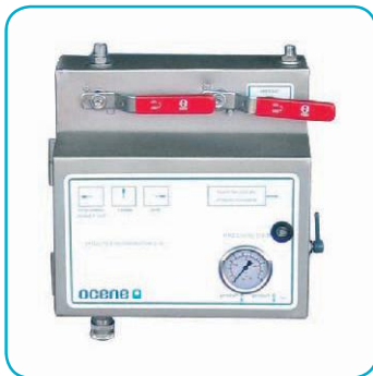
SI 40 satellite