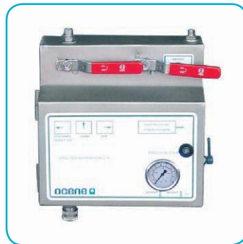
Satellite SI 40