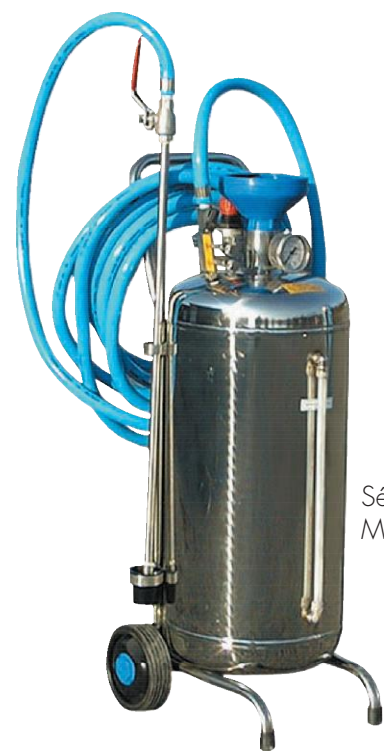
Série ÉCO M24V GD