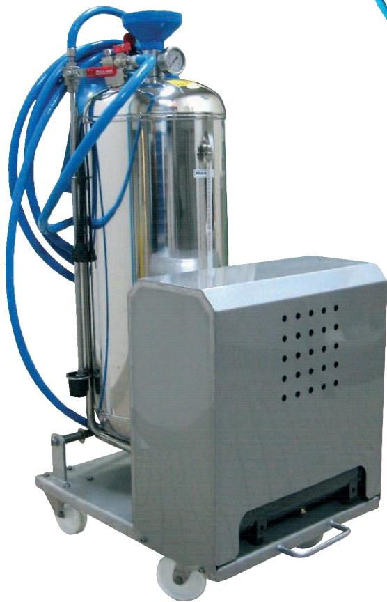
Automousse AM50 V GD