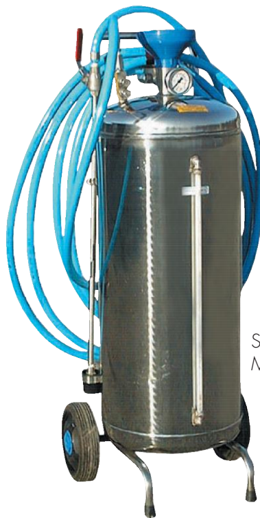
Série ÉCO M50V GD